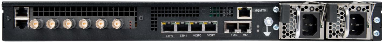
Tdev TMP6400-DS3 AC (rear view)