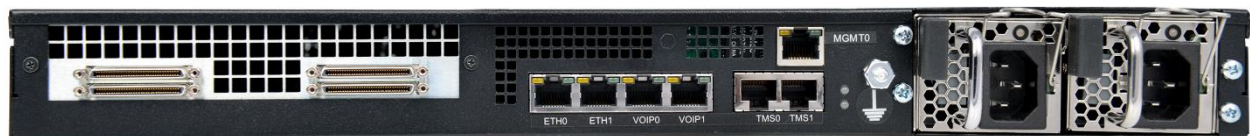
Tdev TMP6400-TE AC (rear view)