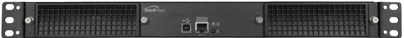
Tdev TMP6400 (front view)

Operating temperature: 0 to +70 °C, 95% rel. hum. non-condensing Storage temperature: -10 to +85 °C, 95% rel. hum. non-condensing Designed to meet NEBS Level 3 RoHS compliant