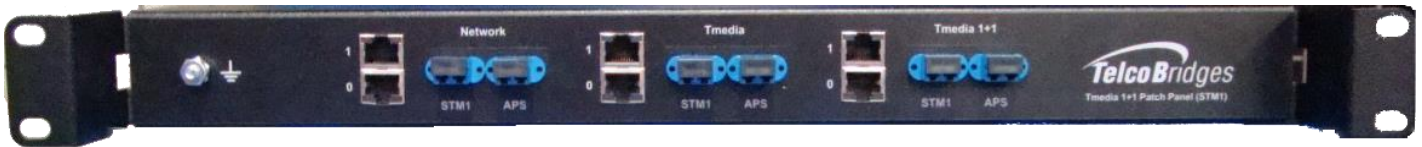
Tmedia/Tdev TMP6400-STM1 1+1, Patch Panel (front view)